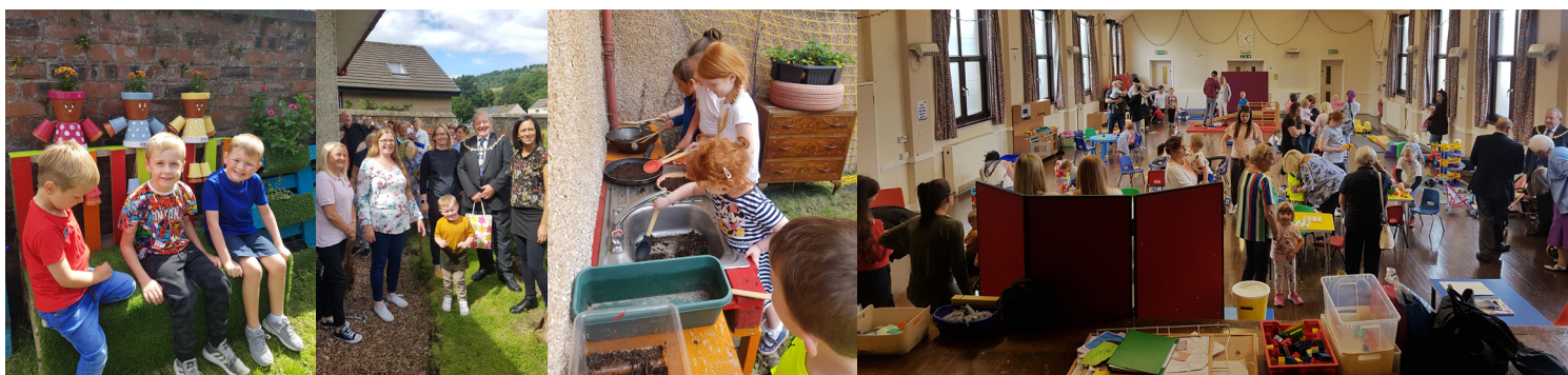
Old Kilpatrick playgroup garden open day

Please contact Julie on our Facebook page (Napier Hall toddlers and playgroup) if you are interested in joining our group.