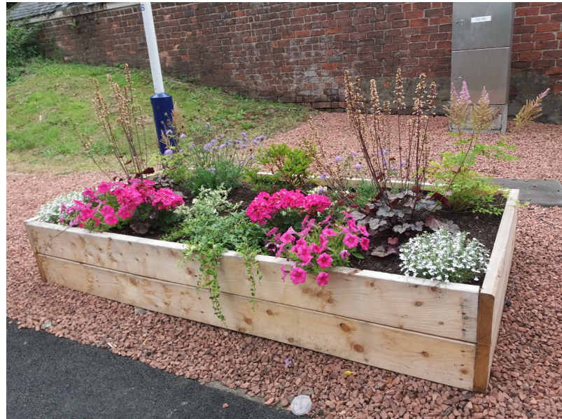
Action Old Kilpatrick adopted the Kilpatrick train station in the summer and are now looking after three planters on both platforms of the station. Huge thanks to Murphy contractors for providing the soil!