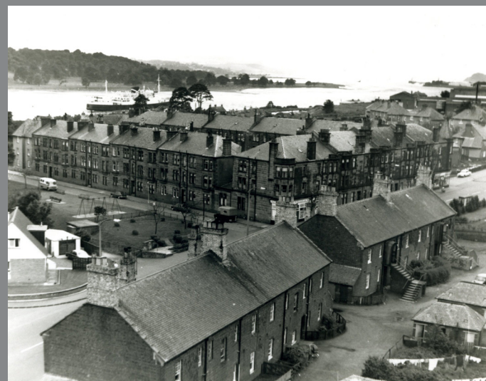
A1934 Dumbarton Road, early 1970s Back of Kirkton and Gavinburn St beyond

Please visit our social media for more up to date information on our activities and events