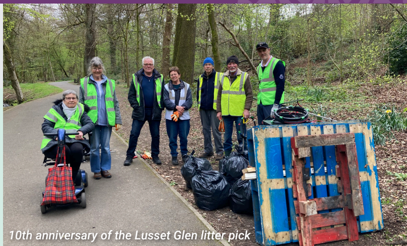
10th anniversary of the Lusset Glen litter pick