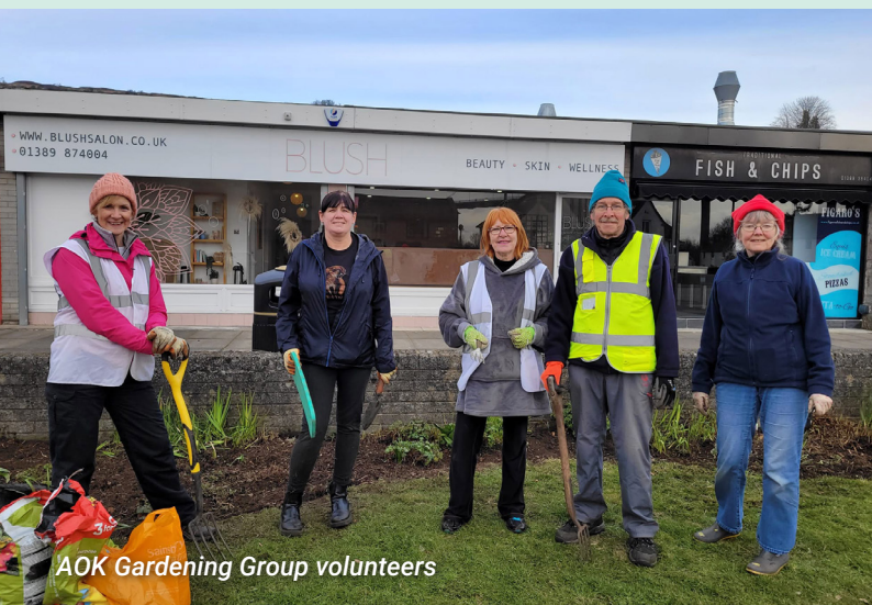
AOK Gardening Group volunteers

Please do consider joining us for our twice monthly litter picks, meeting at the AOK container next to the Scout Hall on Erskine Ferry Road on the last Monday for Lusset Glen and the first Sunday of the month for the Saltings, both at 10.00 am, finishing around 12noon. All equipment will be provided. Together we can make a difference.